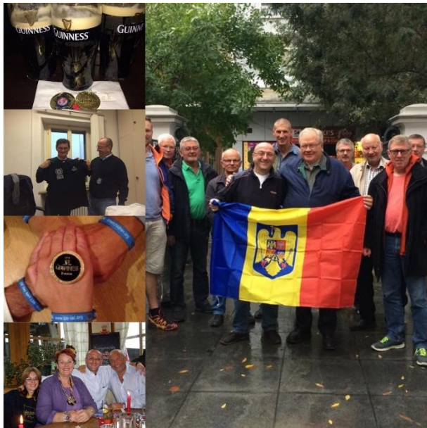
IPA friendship around the World: Austria, Denmark, Italy, as well as the Guinness Forum friendship 😊

Working in mostly small and medium-sized companies, our members can make decisions fast, and are not so stuck with regulations. On the other hand we do not have the rights and official networks law enforcement have.